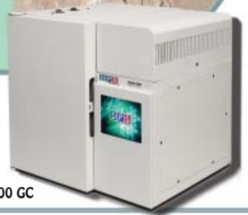
Series 600 GC